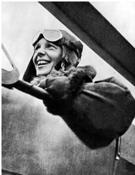
Amelia Earhart