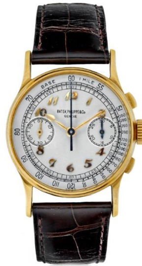
Patek Philippe A Rare and Historically Important 18k Gold Chronograph Wristwatch with Breguet Numerals Formerly Belonging to American Major League Baseball Legend Joe DiMaggio Estimate: $150,000 – 300,000