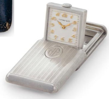
Cresarrow Watch Co. Signed Tiffany & Co. A Fine Silver Travel Watch Formerly Belonging to American Aviation Pioneer Amelia Mary Earhart Estimate: $60,000 - 120,000